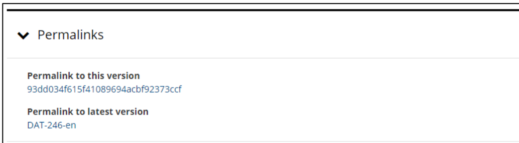
Figure 2 Overview of the content of the fiche of this dataset entry