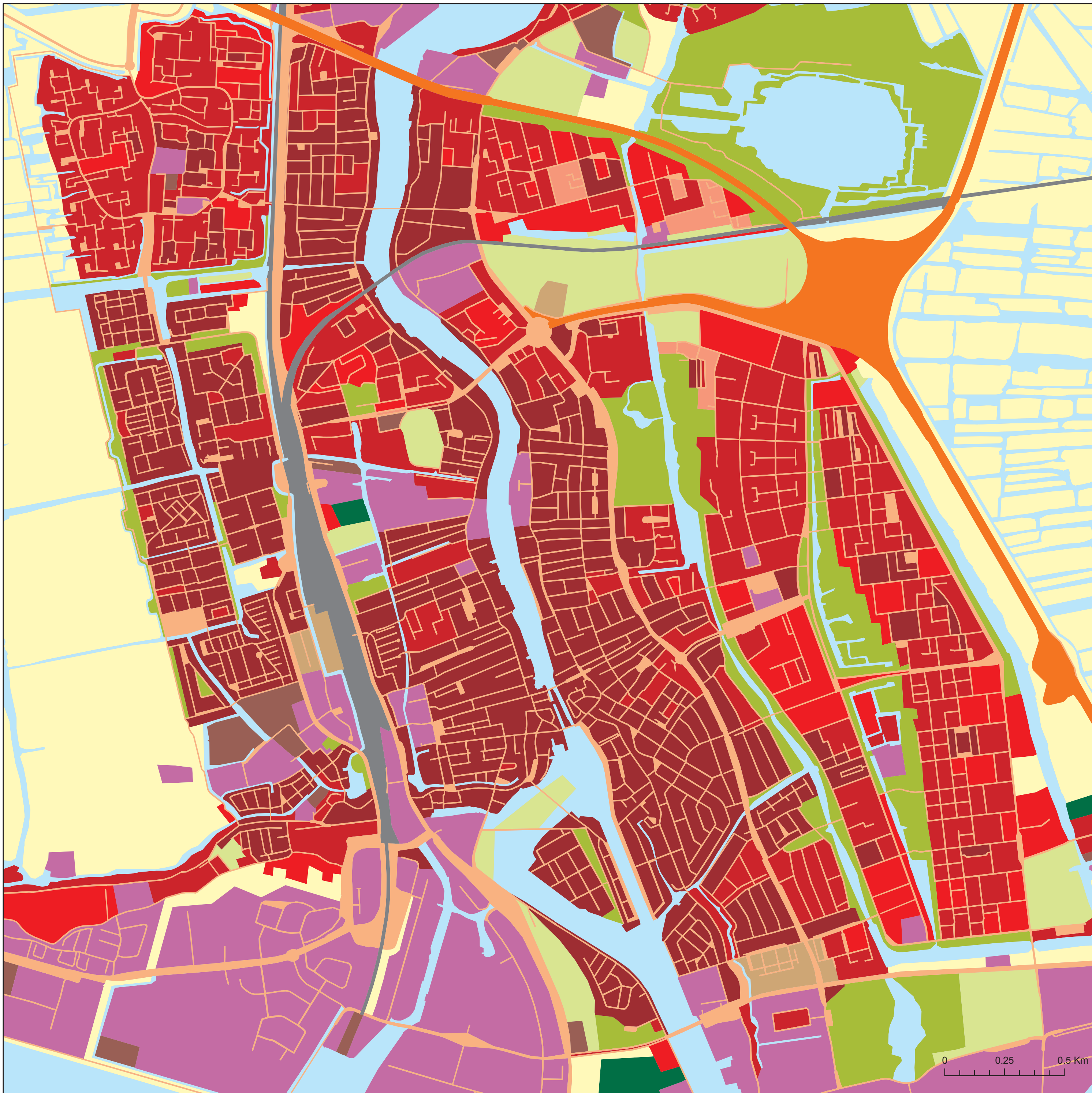
Larger Urban Zone: Amsterdam