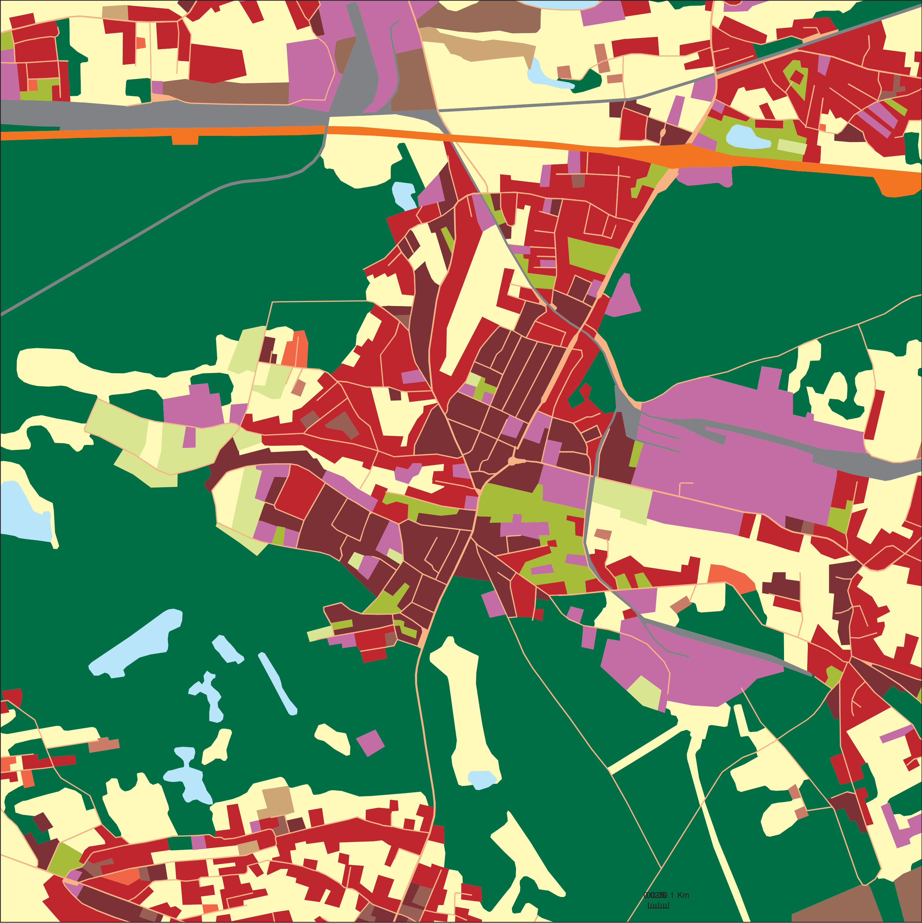
Larger Urban Zone: Katowice