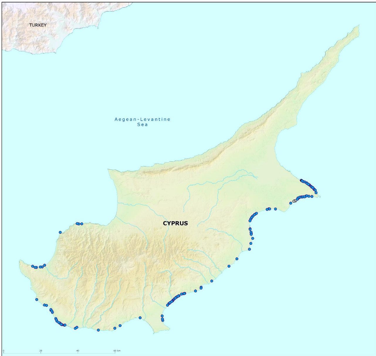
Map 1: Bathing waters reported during the 2022 bathing season in Cyprus