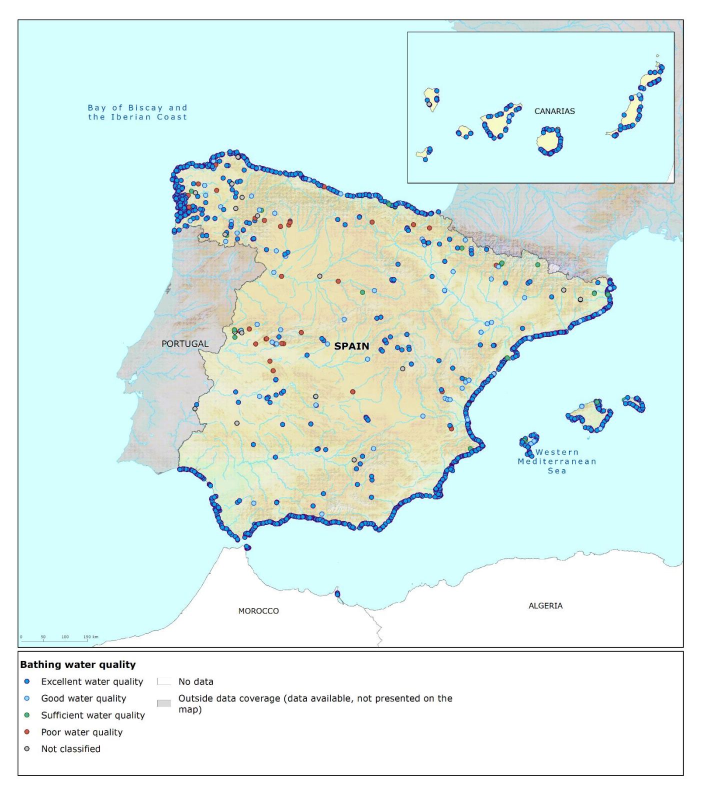
Map 1: Bathing waters reported during the 2023 bathing season in Spain