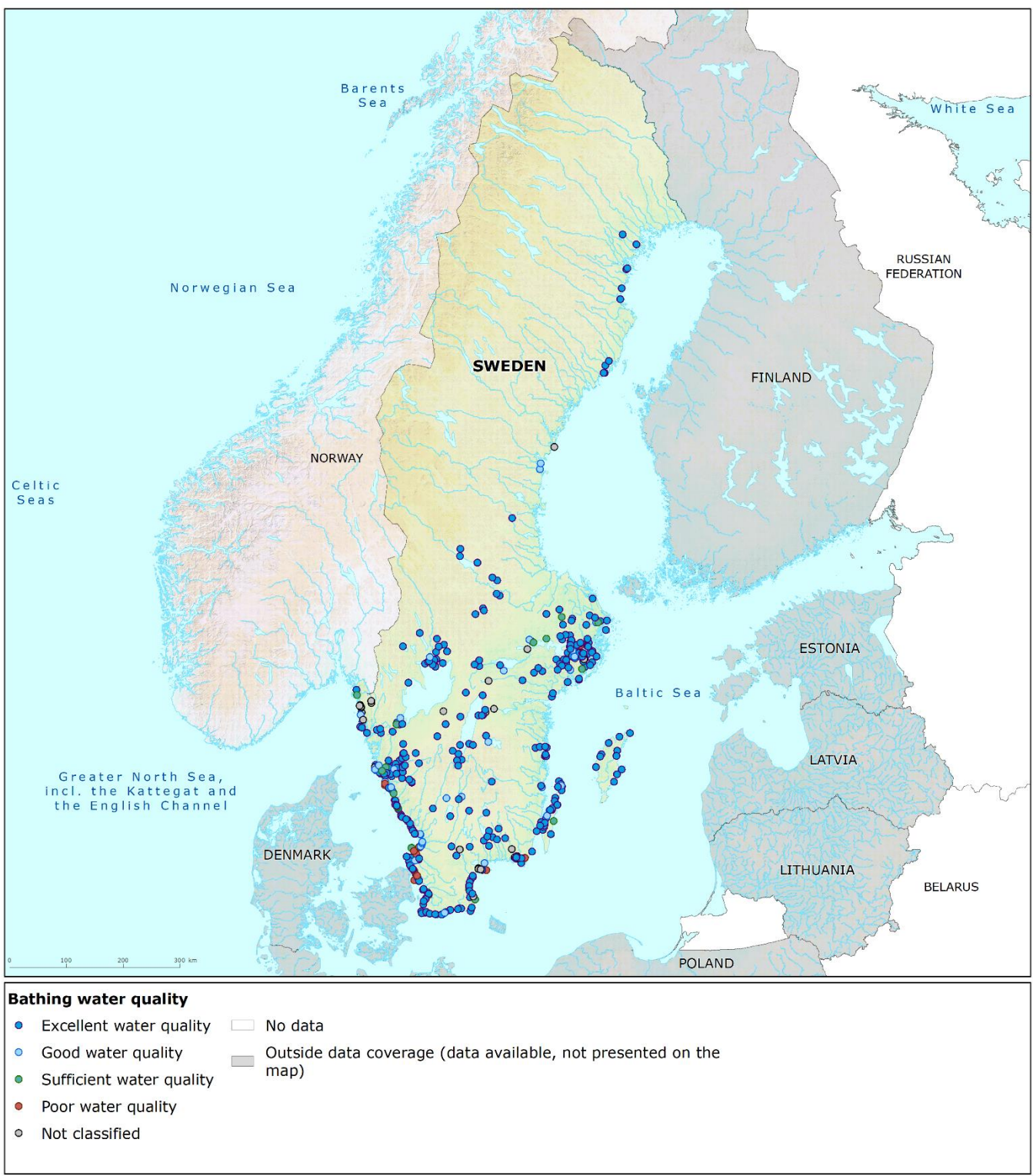
Map 1: Bathing waters reported during the 2023 bathing season in Sweden