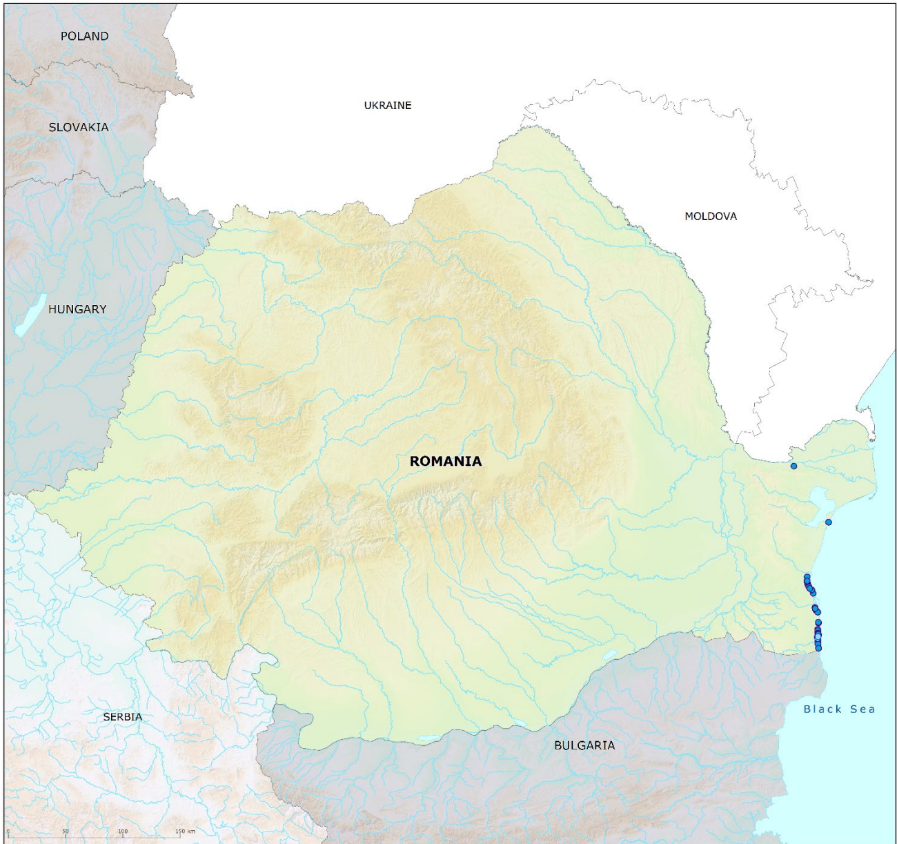
Map 1: Bathing waters reported during the 2022 bathing season in Romania