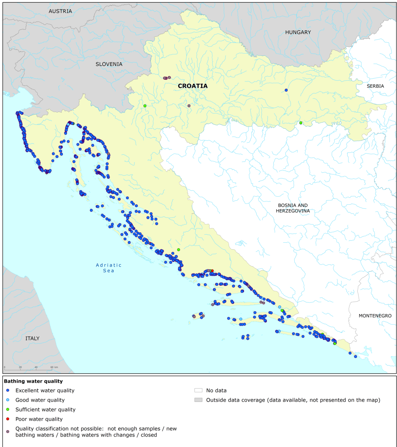
Map 1: Bathing waters reported during the 2014 bathing season in Croatia