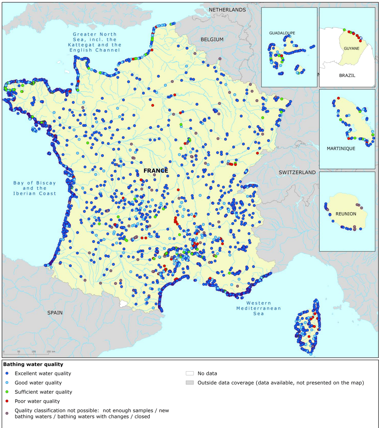
Map 1: Bathing waters reported during the 2014 bathing season in France