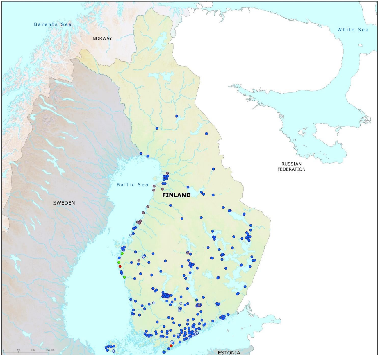
Map 1: Bathing waters reported during the 2016 bathing season in Finland