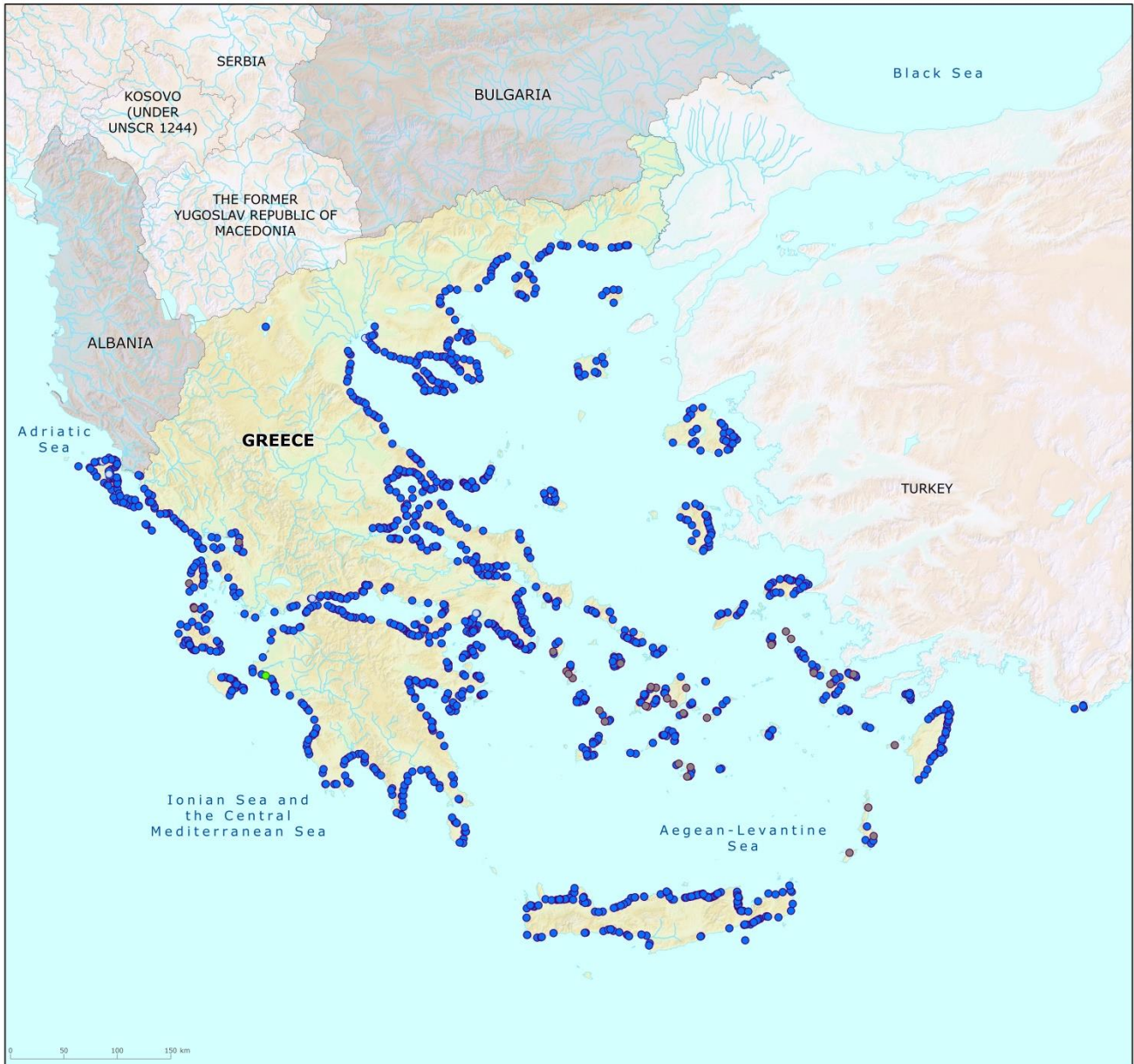
Map 1: Bathing waters reported during the 2016 bathing season in Greece