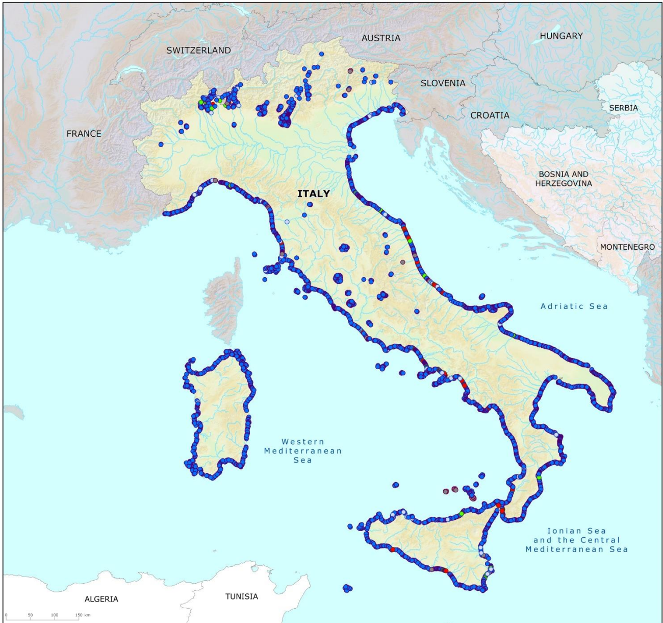
Map 1: Bathing waters reported during the 2016 bathing season in Italy