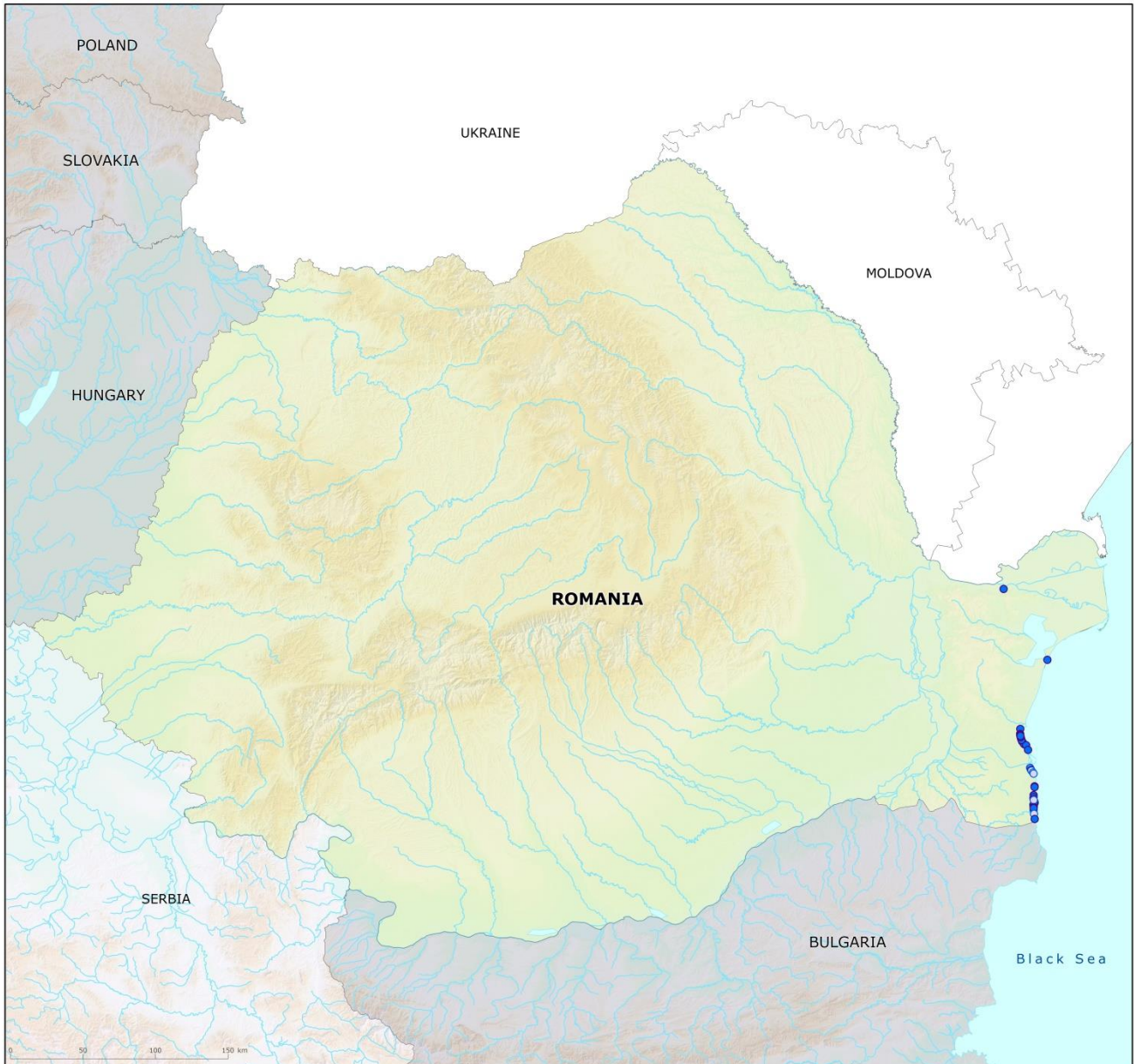
Map 1: Bathing waters reported during the 2016 bathing season in Romania