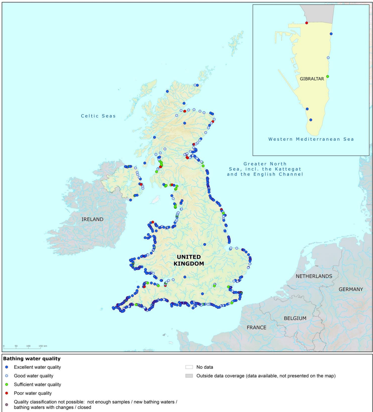
Map 1: Bathing waters reported during the 2016 bathing season in the United Kingdom