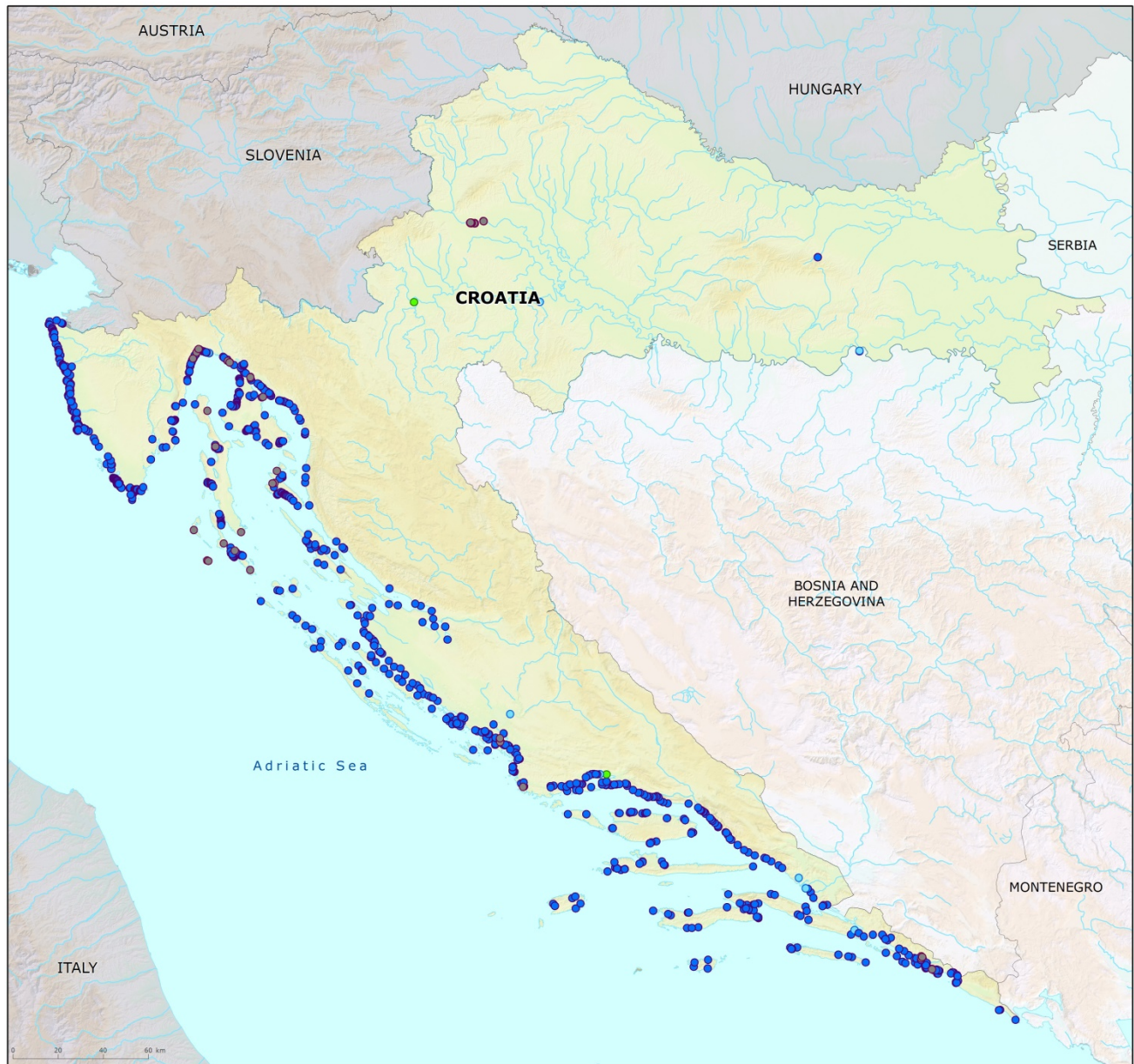
Map 1: Bathing waters reported during the 2017 bathing season in Croatia