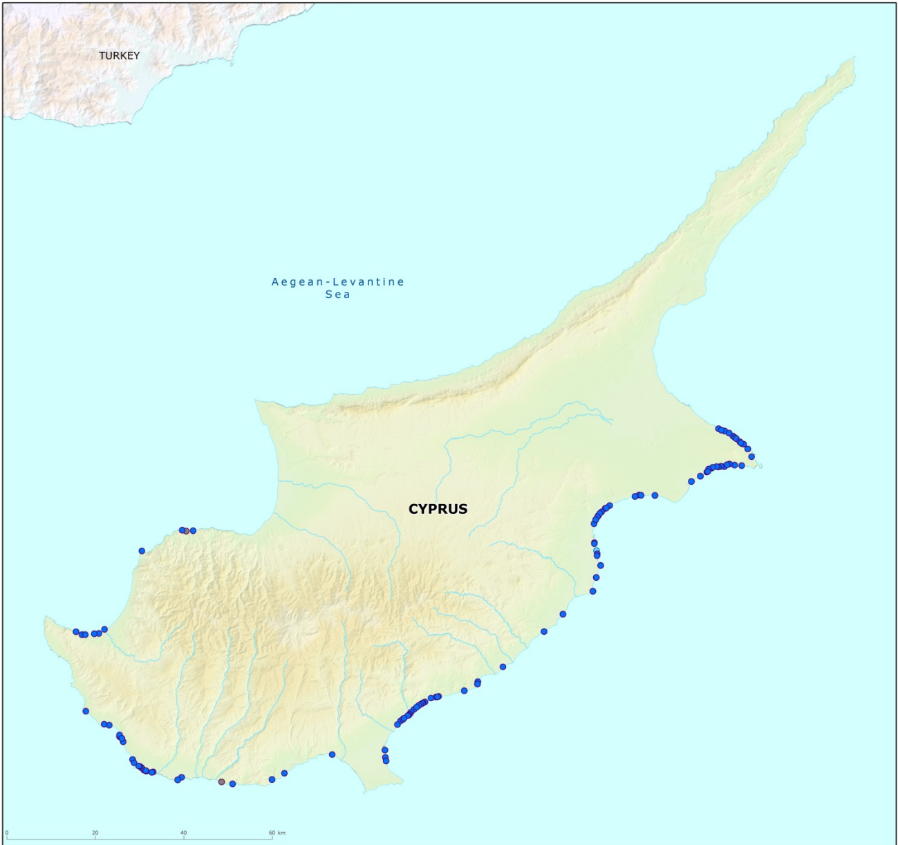
Map 1: Bathing waters reported during the 2017 bathing season in Cyprus