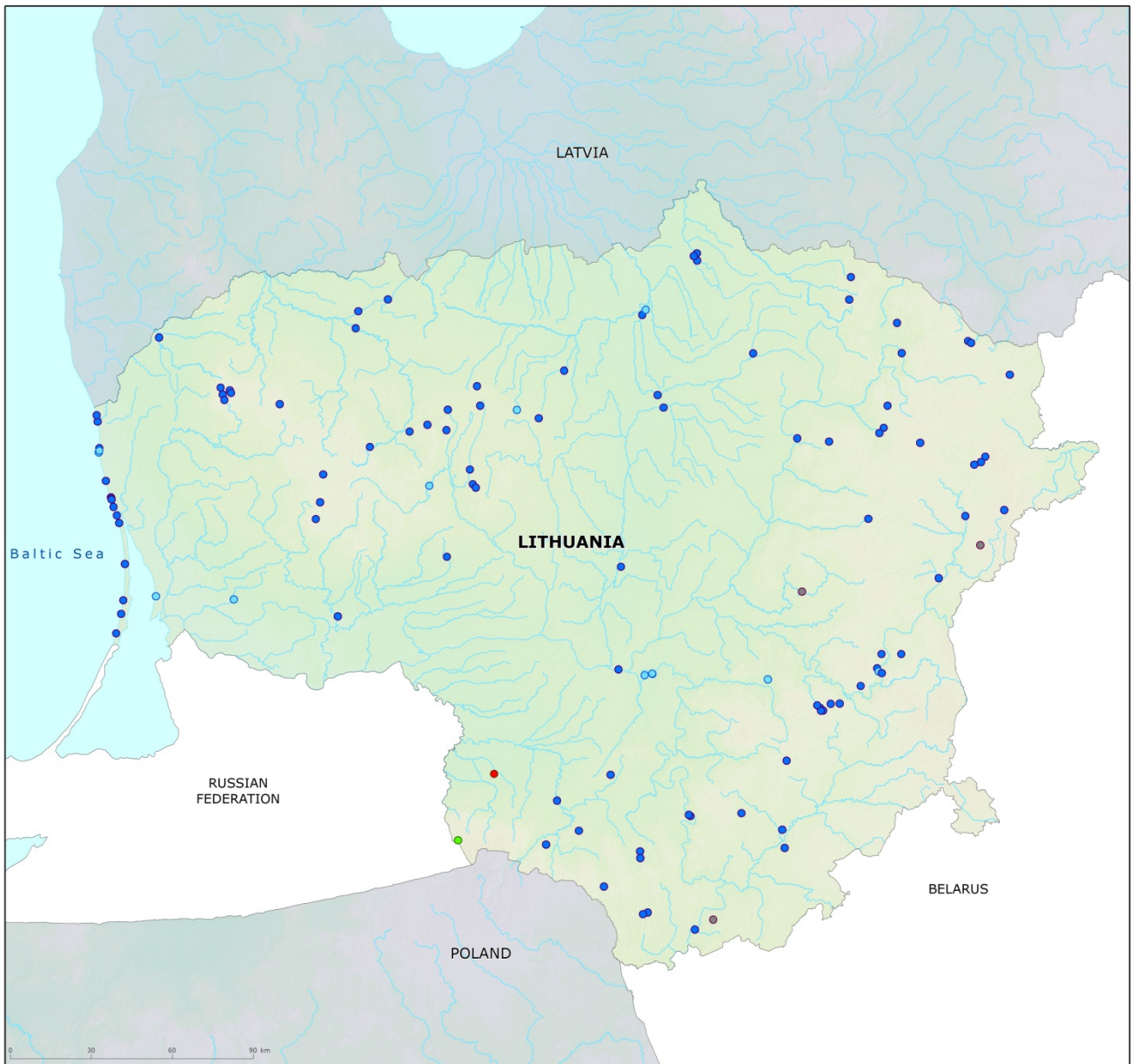
Map 1: Bathing waters reported during the 2017 bathing season in Lithuania