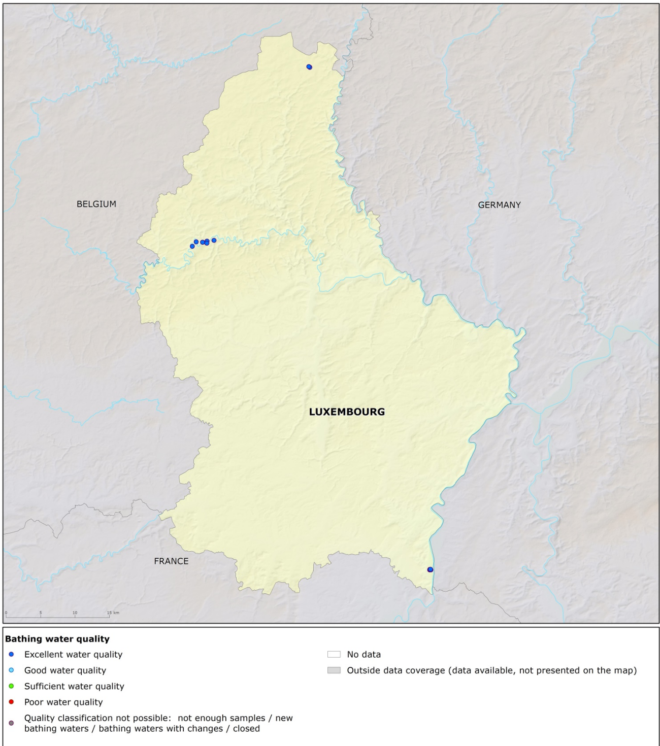
Map 1: Bathing waters reported during the 2017 bathing season in Luxemburg