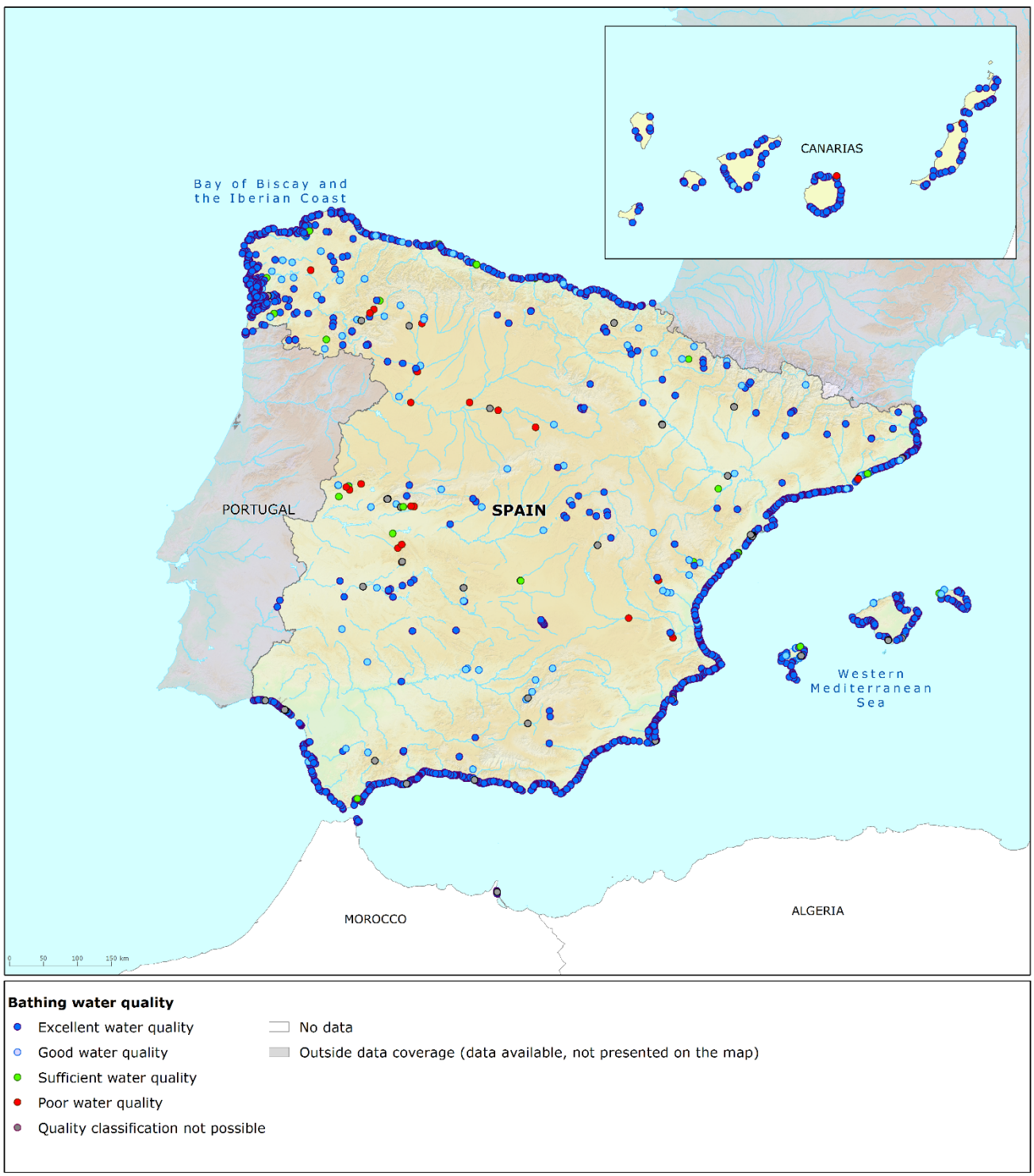
Map 1: Bathing waters reported during the 2021 bathing season in Spain