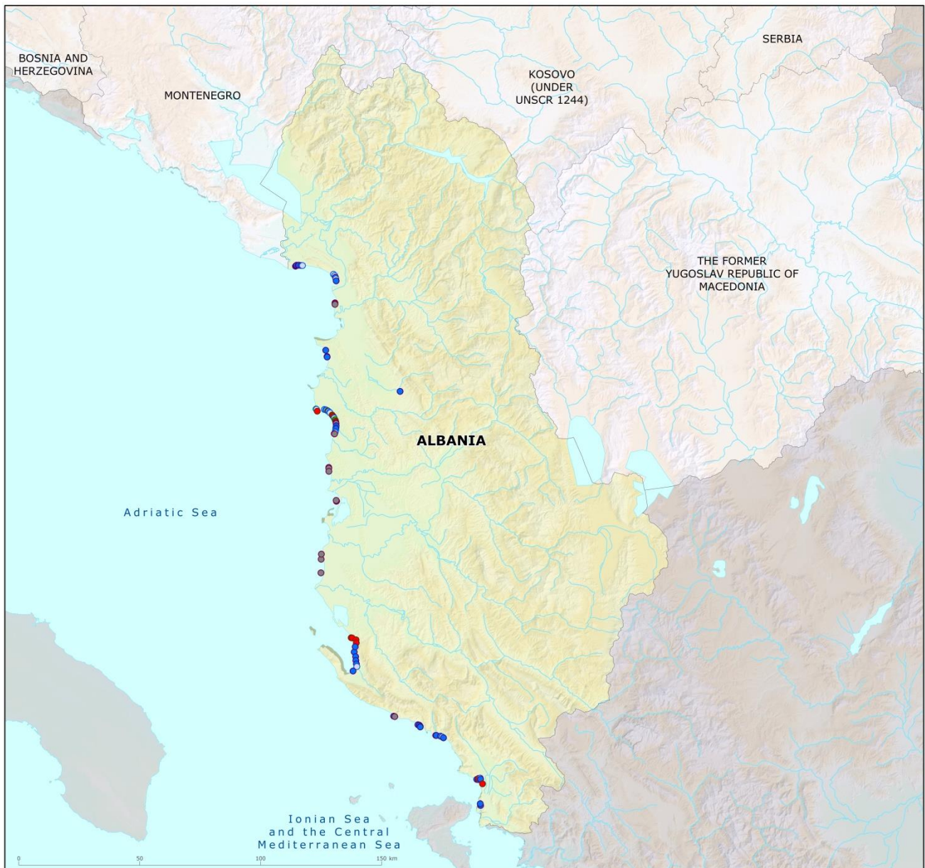
Map 1: Bathing waters reported during the 2016 bathing season in Albania